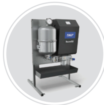
RECOND OIL BOX

Your oil does not age. It can be re-generated. Our Double Separation Technology (DST) changes the way you think about the oil: from a costly consumable to a full circular asset. DST helps the oil to become cleaner than even before and goes beyond conventional filtering. Recond Oil box can be used anywhere there is a heavy oil consumption.